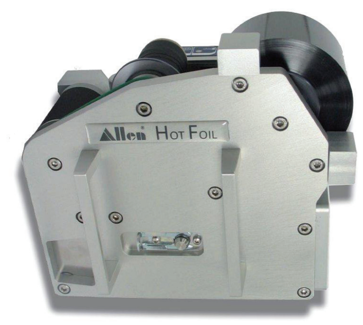
50/30 Hot Foil Coder

applications. The unit can be used as a standalone