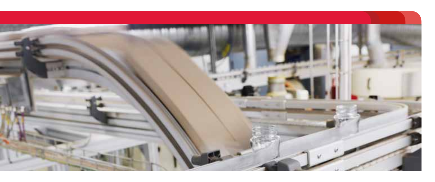
Elevation in a continuous flow, without stops or capacity losses. The solutions are easily adjustable for different product sizes.

By elevating the production flow, you reclaim valuable floor space and makes it possible to add more production capacity or increase accessibility for your operators.