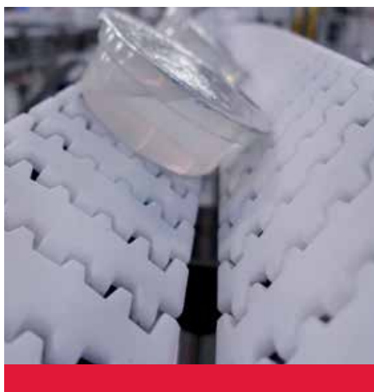
Standardized functions for high speed flows.