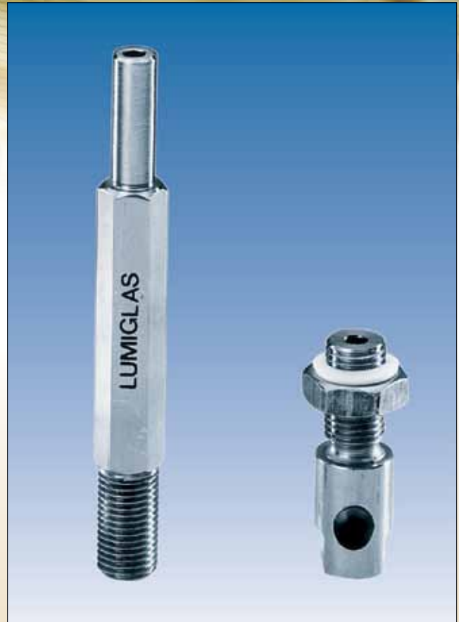
Spray unit and feed nozzle designed for sightglass flanges to DIN 28120.

If ordering as separate item, always state operating parameters as well as details of flange/glass materials and dimensions.