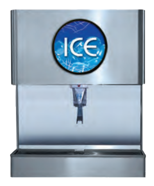
ID 4400 30" 250 lb Ice Dispenser

The ID 4400 30" is designed using the highest quality materials and state-of-the-art technology providing our customers with consistent quality and ice dispensing.