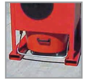
Forklift pockets allow filtration system to be easily moved into desired location.