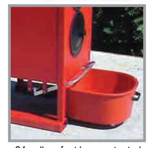
24 gallon, foot lever actuated drop-down dust pan allows for dustless waste removal.