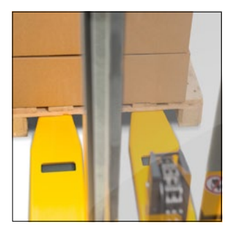
Optimum view of the forks and surrounding areas