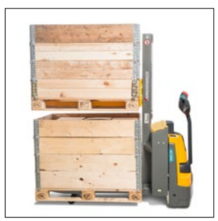
Double-deck operation - loading of two pallets one over the other