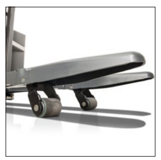
Universal application options thanks to additional support arm lift