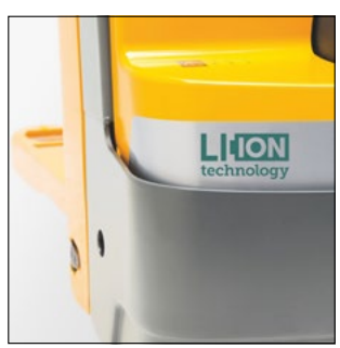
Innovative Li-ion technology