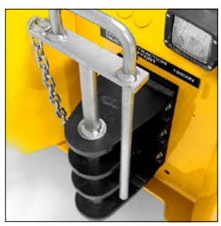
Different couplings available (optional)