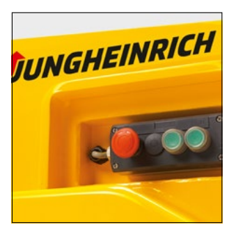
Inching buttons for simple coupling and decoupling