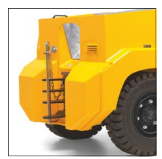
Multi-stage coupling for different trailer coupling