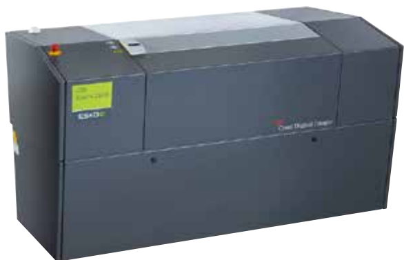
Esko CDI Spark Flexo Digital Imager

ID Technology takes quality to a whole new level by stepping up from traditional HD to Full HD Digital technology. This unique plate making capability provides all of the advantages of traditional HD, along with enhanced quality in solids and whites - spot colors can be printed with higher vignette quality. This is particularly noticeable when reproducing skin-tones for labels destined for beauty products.