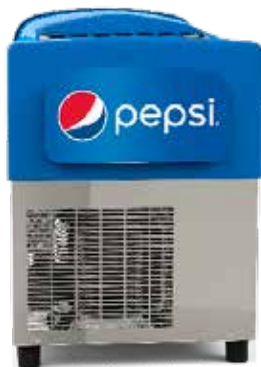
Rear view Illuminated logo