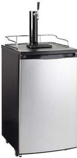
Ecoline-C Kegerator with one tap