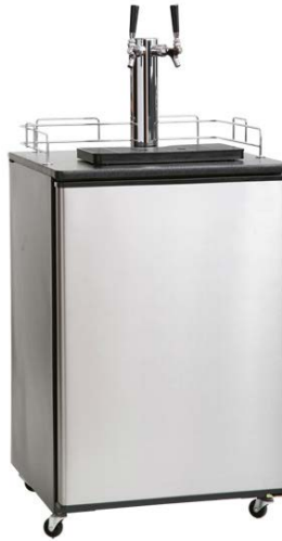
Ecoline-C Kegerator with two tap