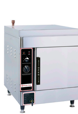
Altair II - 4

The door is insulated. Safety shut-offs are provided by a hidden magnetic door switch, low water/high limit heat switch, temperature probe, water sensing probe and water-fill timer.