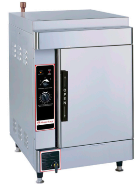
Altair II - 6