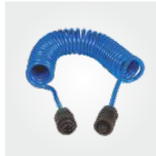
Cen-Stat cable supplied with male and female in-line Quick-Connects.

The spiral cable provides effective retractability when the clamp is not in use, ensuring the cable is neatly stowed and safely out of the way.