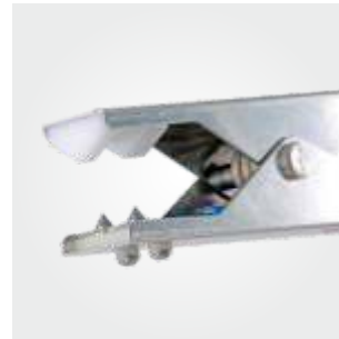
Tungsten Carbide Teeth