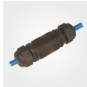
In-Line Quick Connect.

The Bond-Rite® EZ forms part of the Bond-Rite® range of Static Grounding and Bonding Equipment available from Newson Gale