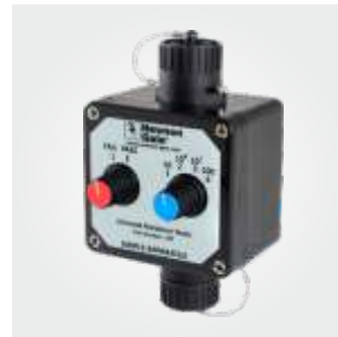
Universal Resistance Tester Product Code: URT.