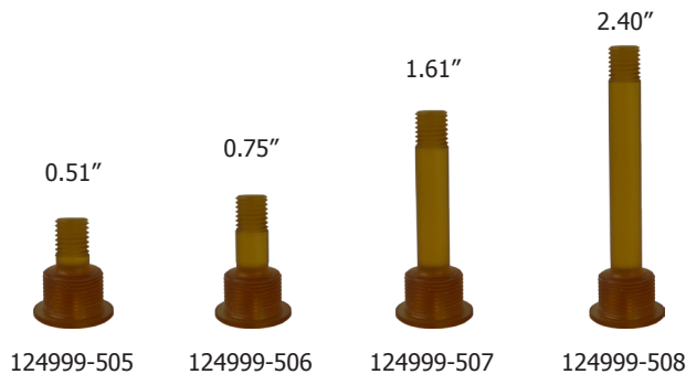
Measurements to bases of assembled standoffs